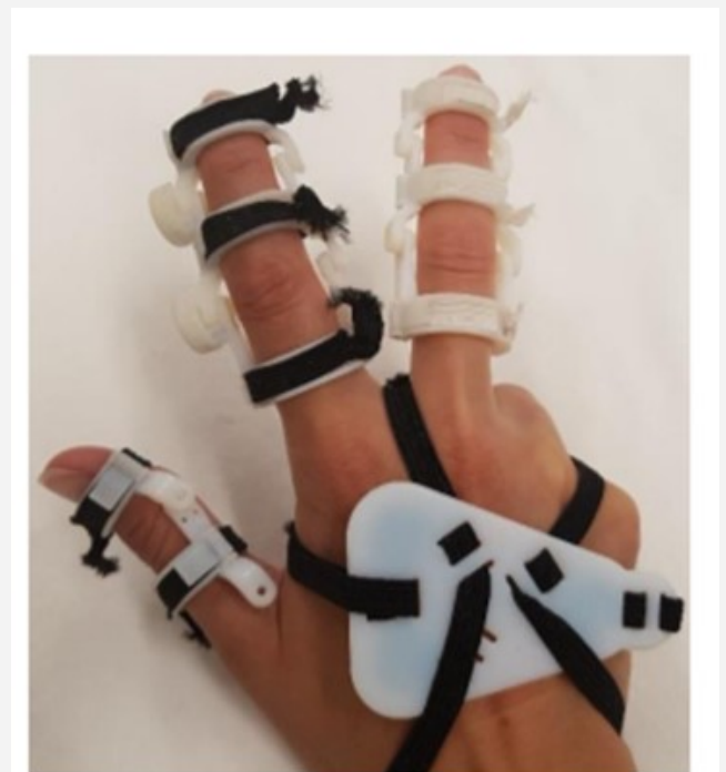
Initial prototype of rigid exoskeleton for use with hall-effect sensors

In parallel to the rigid/soft design of the previous section, a 2nd design is being developed for use exclusively with Hall-effect sensors , but with ergonomically improved design. This exoskeleton also benefits from the parametric design for different hand sizes custom fit and has the advantage of not requiring calibration before each use (due to lack of IMUs). The design includes two plates, one for the palm and one for the dorsal side of the hand. These are intended for holding a mechanism and are essentially replacing the hook-and-loop fasteners of the pre-SMARTsurg design. For a comfortable but snug fit, there are soft balancing stands between the top plate and the dorsal side of the hand. Instead of 3D printed flexible straps, the exoskeleton is held onto the digits via elastic fabric which is easily adjustable via a custom-made cam buckle (placed on the top of the hand).