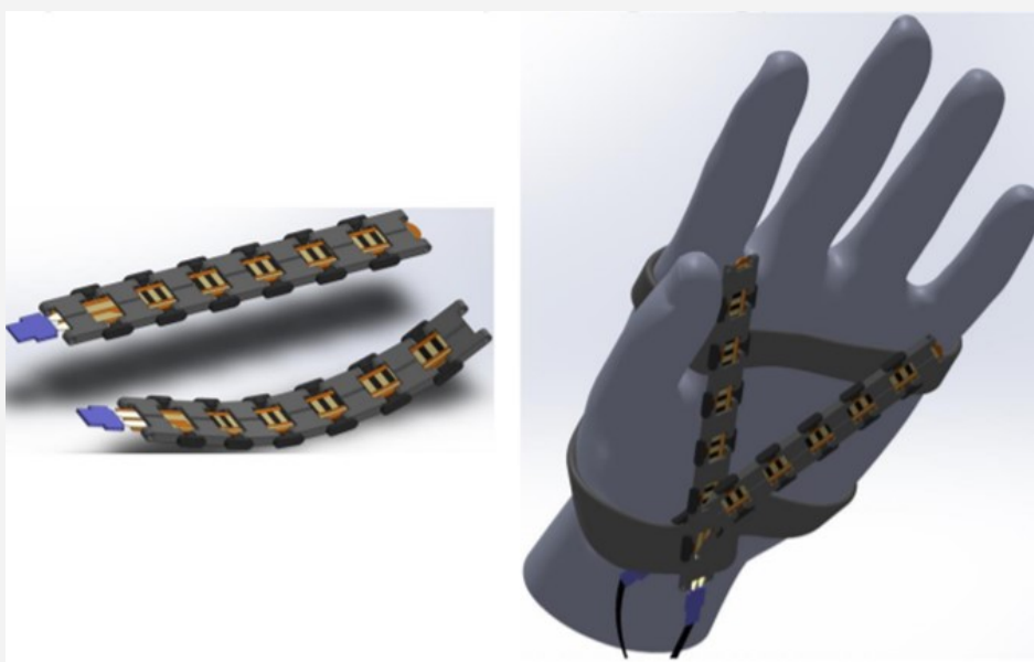
Flex sensor and modular 3D printed chain on the palm

Further to the exoskeleton designs and to address potential problems with the CMC joint of the thumb, an alternative method for measuring change in the flexion of this joint is being developed. This includes flexible film sensors (Flexpoint, USA) that are placed inside the palm of the hand and measure change of resistance due to the change of curvature. These sensors are housed in a modular 3D printed chain, as shown in the next figure, which can be adjusted to various hand sizes by removing/ adding parts of the chain.